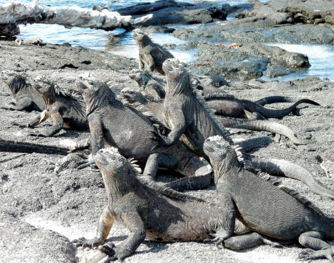
Iguanas were everywhere, some quite colourful, others so dark they blended into their surrounds.