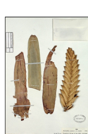
Tillandsia rauhii L.B.Smith herbarium type sheet.

Herbarium: A collection of plant specimens that are dried or otherwise preserved, annotated, identified, and systematically arranged.