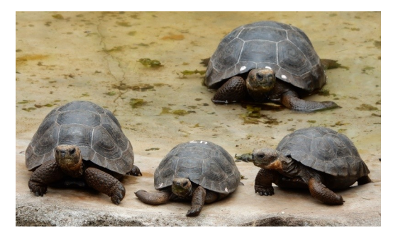
A substantial breeding programme is ensuring the Galapagos tortoise will be around for many generations to come.

Being a group of volcanic islands they aren't all covered in dense tropical vegetation. There are also vast lava fields covered only with