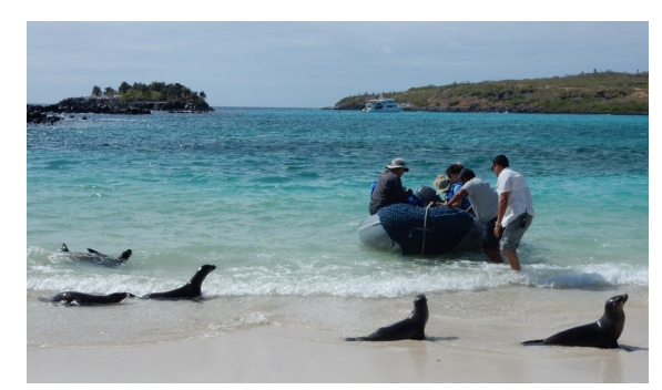
Sea lions greeting us on our first beach landing.

The Eden had a 16 passenger capacity, plus 9 crew, all snorkelling equipment provided and two dinghies to get us from the boat to shore for excursions.