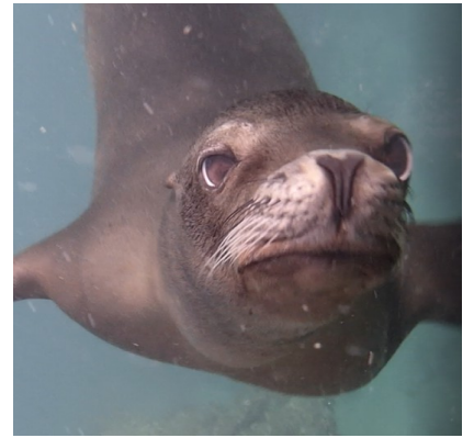
Snorkelling attracted inquisitive visitors!

Of course there were the blue-footed booby, fortunately we were there during breeding season and saw many chicks.